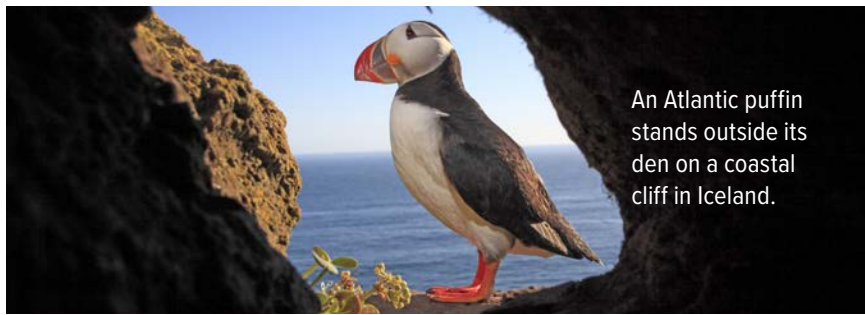
An Atlantic puffin stands outside its den on a coastal cliff in Iceland.