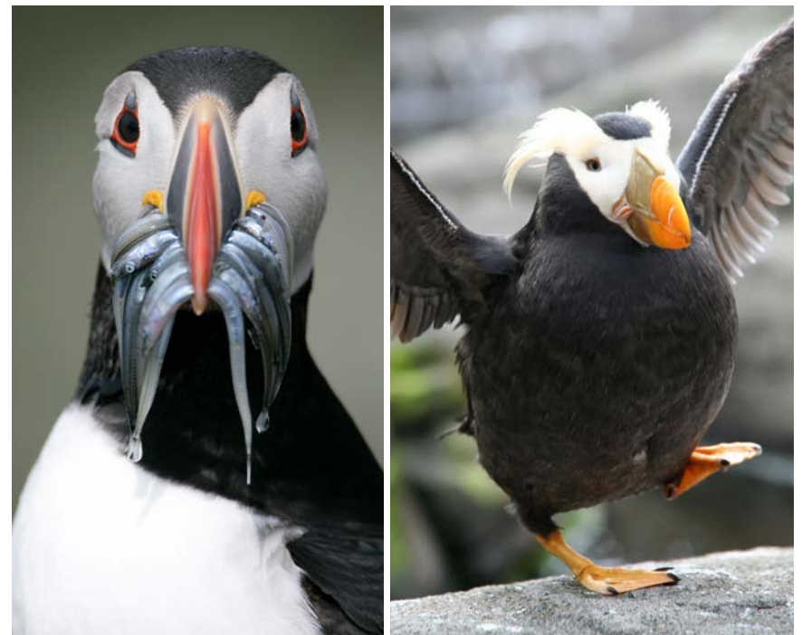
Due to their amusing and colorful appearance, puffins have earned the nickname “clowns of the sea.”