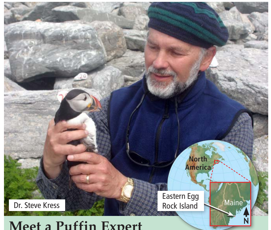
Dr. Steve Kress

In places where puffins live, people are working to solve the problems so these amazing seabirds can continue to live. They are unique members of Earth's natural community. They are also important signs of the health of our oceans. When the oceans are healthy, puffins are healthy.