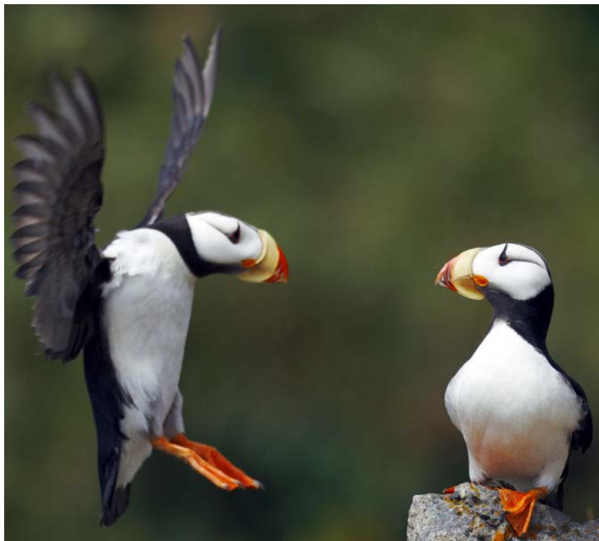
A horned puffin attempts to land on a rock in the Alaska Maritime National Wildlife Refuge.