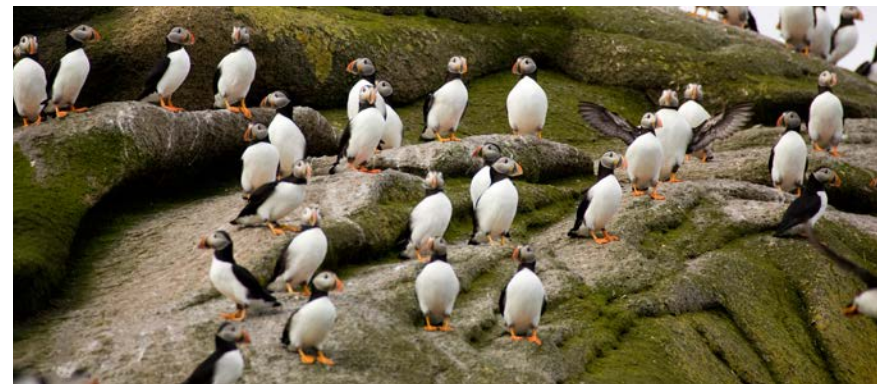
One of the largest Atlantic puffin colonies is in the Labrador Sea, near Canada.

When puffins fly, they flap their wings as fast as 400 beats per minute.