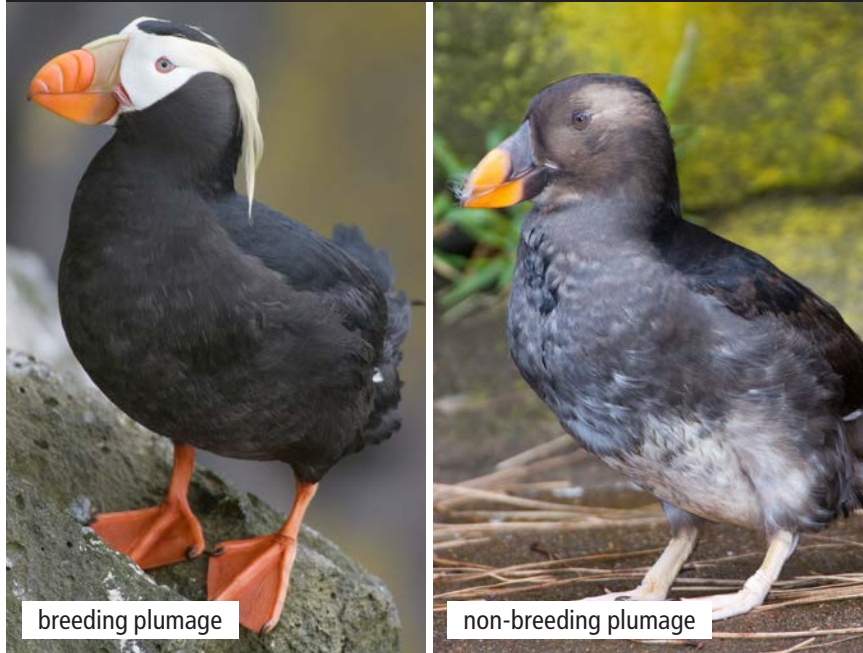
Adult tufted puffins average 15 inches (38 cm) tall.

Tufted puffins live in more places than other types of puffins. They are found on both sides of the North Pacific Ocean as far north as Alaska and as far south as Japan and central California. Unlike Atlantic and horned puffins, tufted puffins have a black chest and belly. In winter, they're black with large red-orange beaks, but they look quite different during the breeding season. They have a white mask, an olive-yellow beak section, and long tufts of gold feathers above their eyes. Orange feet and eye rings complete their summer look.