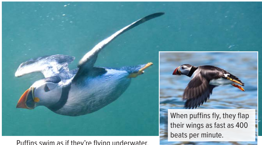
Puffins swim as if they're flying underwater.

You might think that puffins' expert swimming abilities would take away from their flying skills. That's a common myth about these birds, but they're actually quite capable in flight. They also walk with ease over rocks and other surfaces.