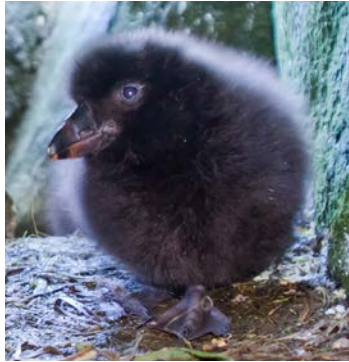
A newly hatched puffin is called a puffling !

Puffins usually return from the sea in late March or early April. During the breeding season, they often live in colonies as large as several thousand birds. They usually stay with the same mate and return to the same nesting sites yearly. Once they return, each pair prepares a burrow where the female lays a single egg. Tufted and European Atlantic puffins, along with rhinoceros auklets, usually dig burrows in soft soil. Horned and North American Atlantic puffins instead often nest in openings between rocks on coastal cliffs.