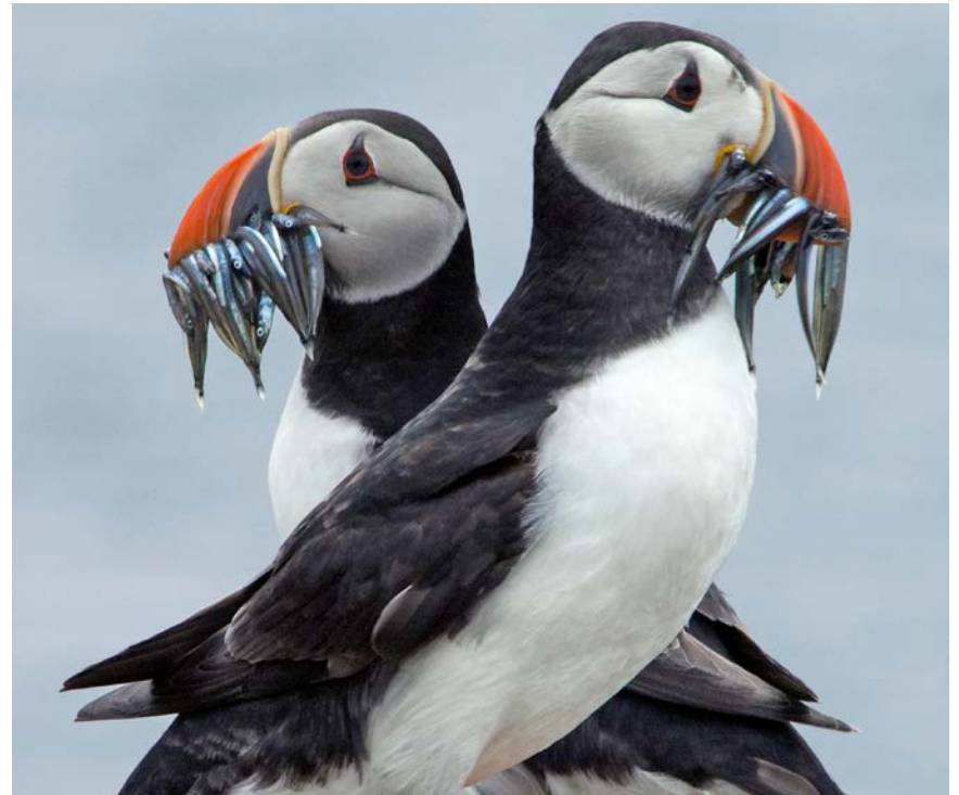
Puffins can “stack” dozens of fish at a time.

Adult puffins eat while they are underwater. They also collect fish to take back to their chicks. Puffins can carry fifteen or more fish in their beak at a time. Their rough tongue and the spines on the roof of their mouth help them hold the fish.