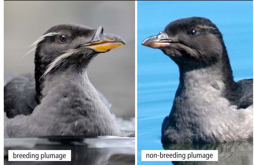
Adult rhinoceros auklets average 13.8 to 15 inches (35 to 38 cm) tall.

Rhinoceros auklets are less well known than the other puffins. They also look very different, which is why they are sometimes considered close cousins instead of actual puffins.