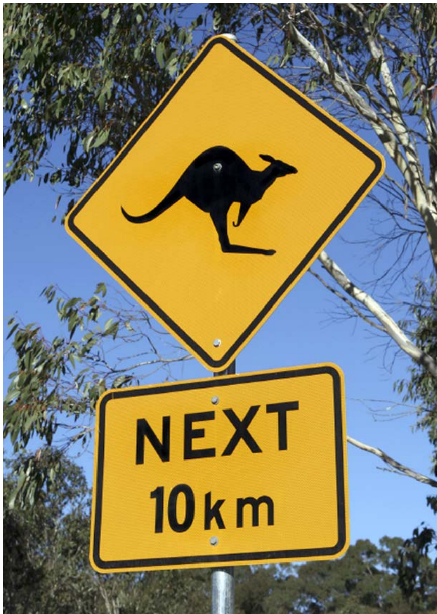
Caution. Watch for kangaroos.