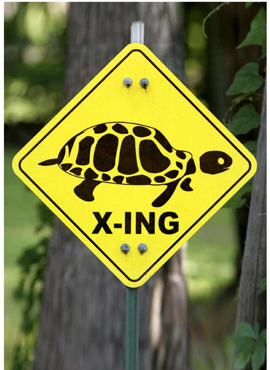
Caution. Watch for turtles.