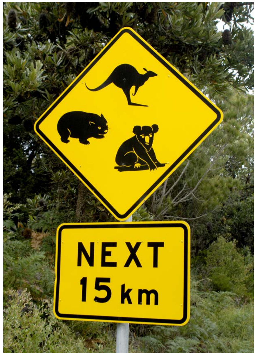
Caution. Watch for animals.