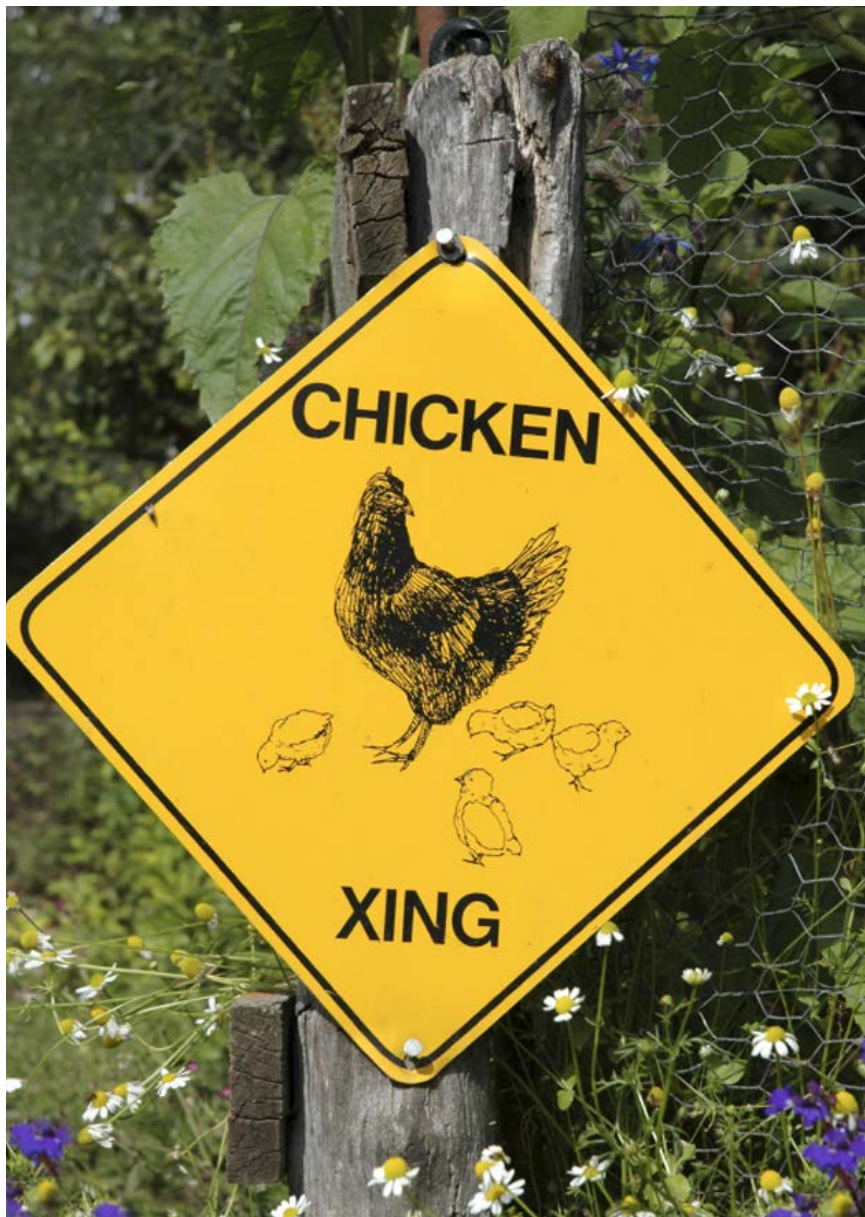
Caution. Watch for chickens.