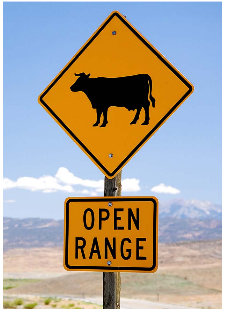
Caution. Watch for cattle.