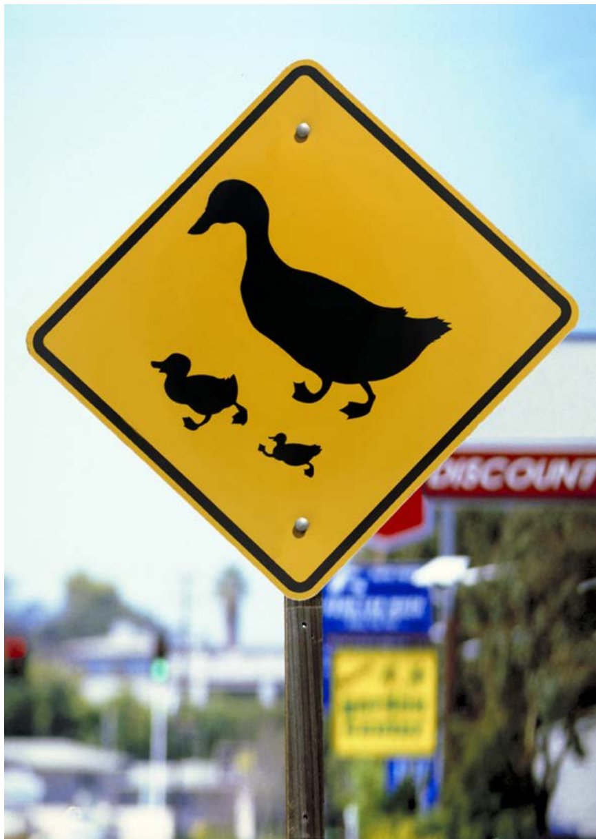
Caution. Watch for ducks.