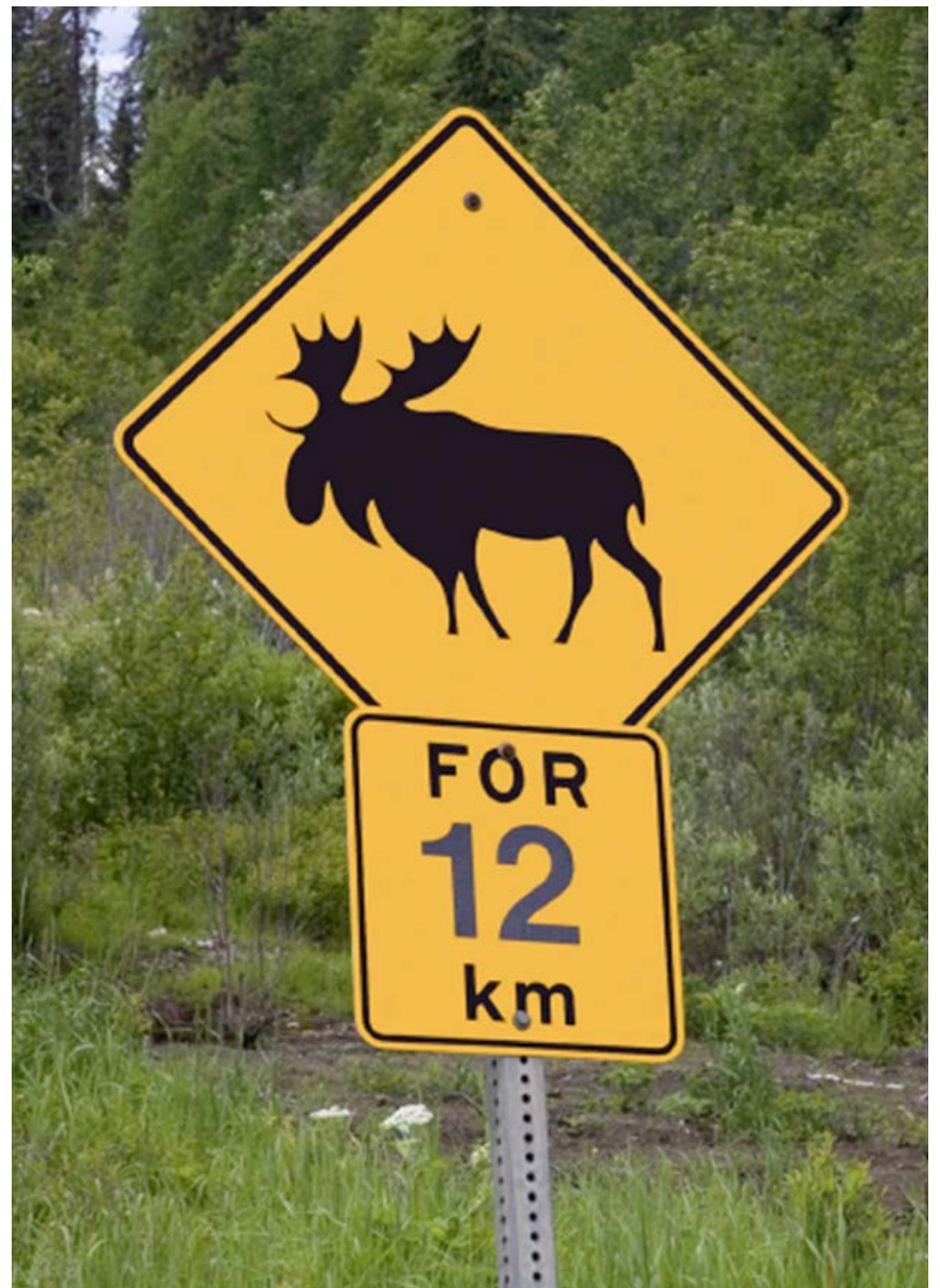
Caution. Watch for moose.