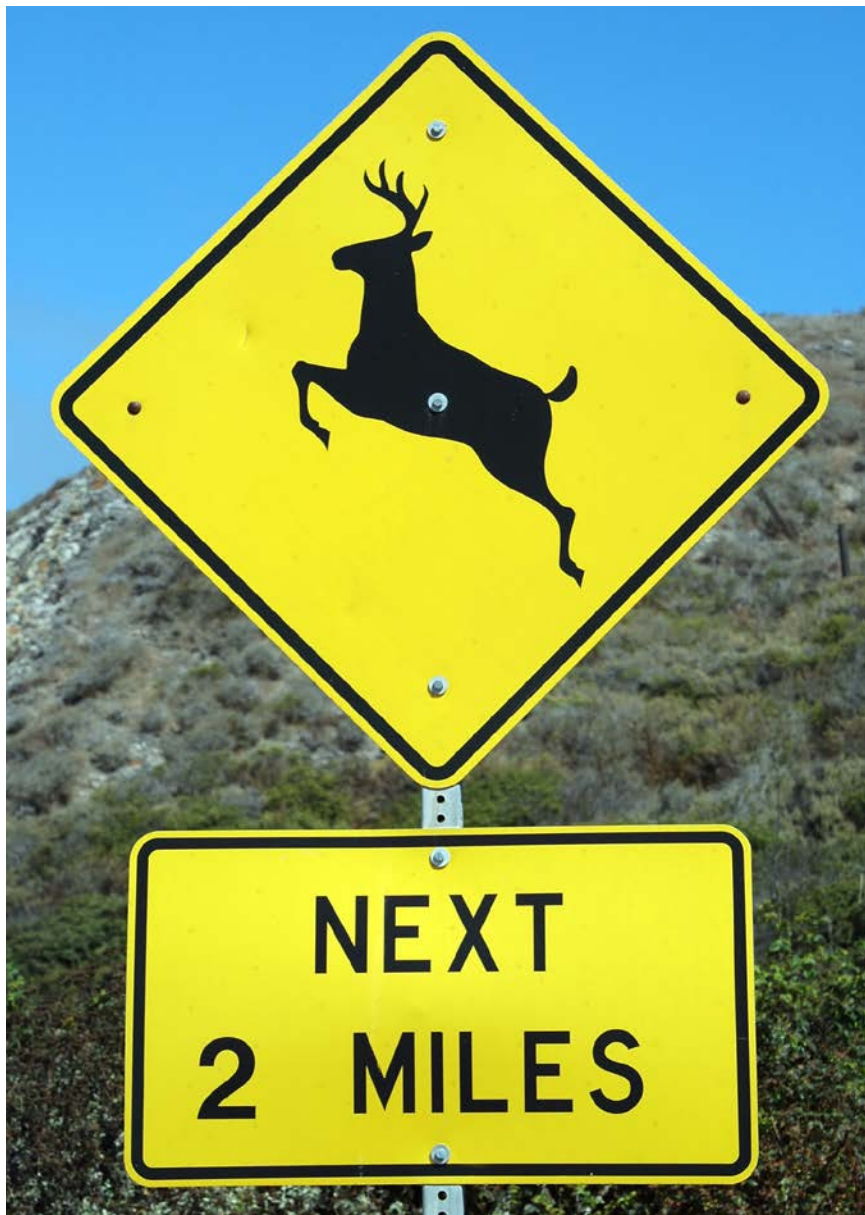
Caution. Watch for deer.