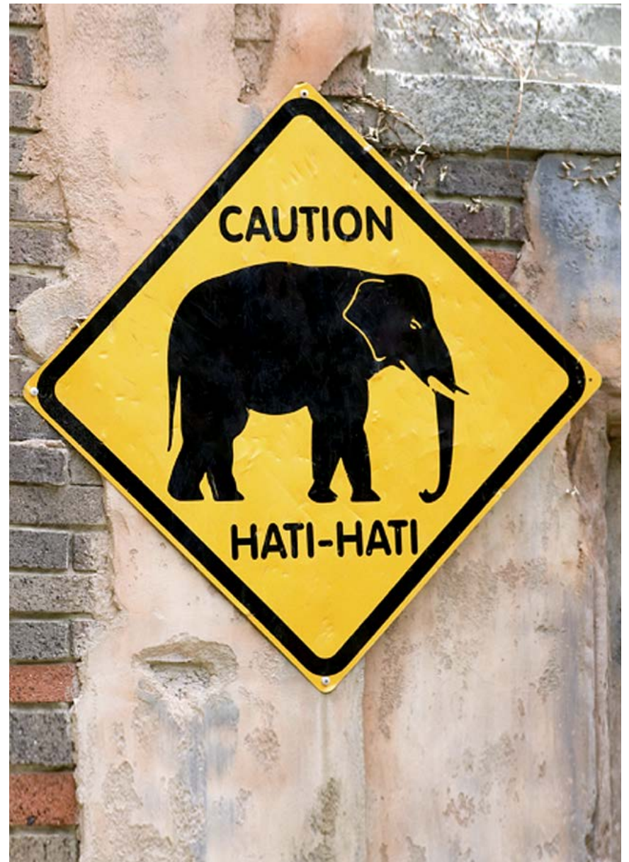
Caution. Watch for elephants.