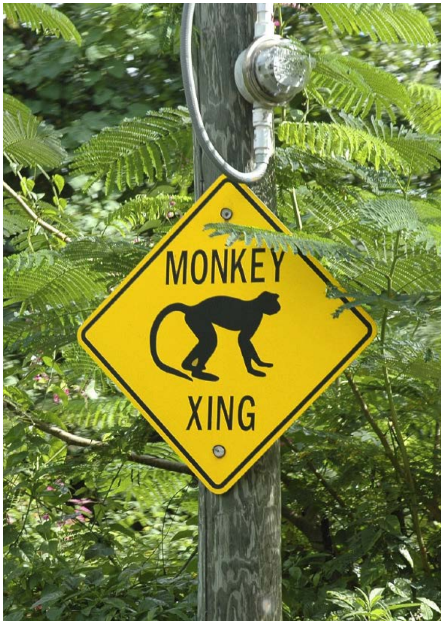
Caution. Watch for monkeys.